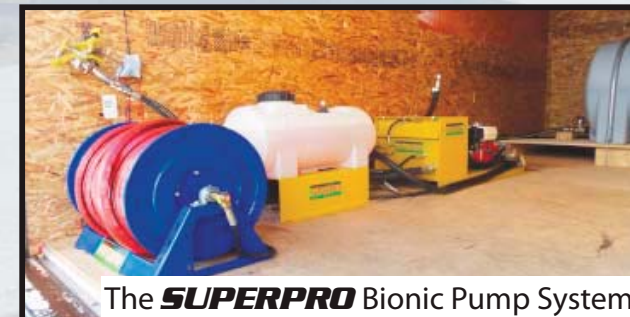
The SUPERPRO Bionic Pump System

Most concrete and masonry foundations experience cracks very soon after being poured. By using SUPERPRO Foundation Waterproofing, typical 1/8" (3mm) foundation cracks are bridged with ease making leaks a thing of the past.